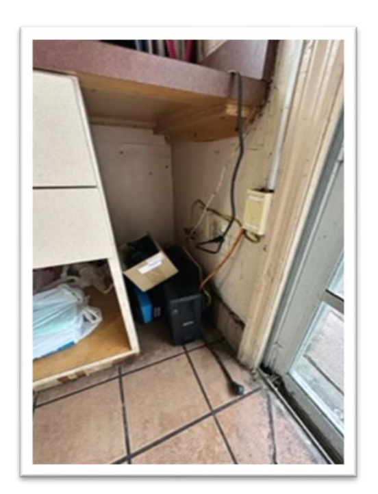
Governmental Management Services-South Florida, LLC 5385 N. Nob Hill Road Sunrise, FL 33351