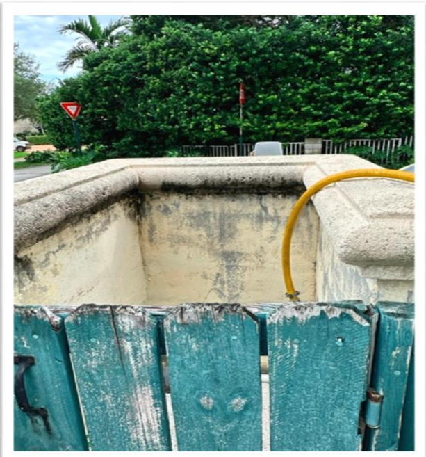
Governmental Management Services-South Florida, LLC 5385 N. Nob Hill Road Sunrise, FL 33351