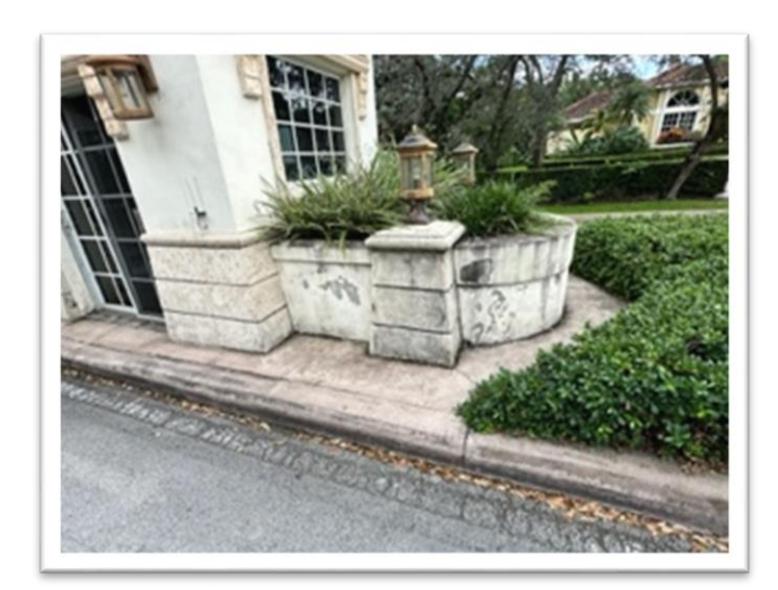
Governmental Management Services-South Florida, LLC 5385 N. Nob Hill Road Sunrise, FL 33351